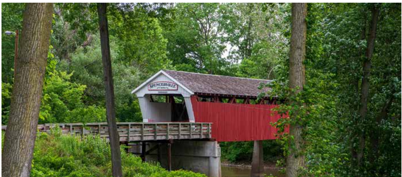
The historic Spencerville Covered Bridge in DeKalb County, Indiana, was built in 1873 and spans the St. Joseph River. In 2021, it was identified as a top priority among the thousands of rural bridges in the United States worthy of repair in President Joe Biden's "American Jobs Plan."

As remote working becomes more common, in part because of the pandemic but also because of improved