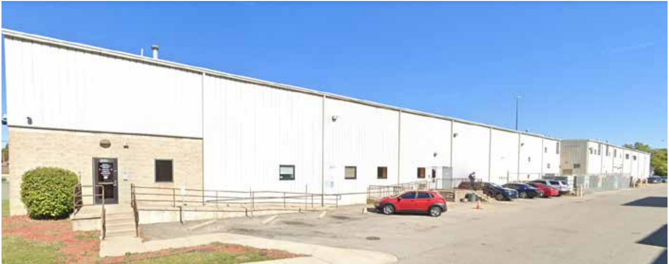
CHJR and CRISP partnered with Community Solutions and Marion County Community Corrections to research reentry services at Duvall Residential Center, a male-only facility on Indianapolis' near eastside with 350 beds. Residents may leave for work, school, or medical attention.

conducted by IDOH staff. First responders who receive these naloxone doses are asked to complete a CHJR survey after administering each dose. Surveys record information about first responders, overdose victims, naloxone administration, the scene of the overdose, and outcomes. Data from the FR-CARA project has been used to identify and target populations most at risk for opioid overdose, inform decision making and funding around harm reduction strategies for opioid use. It also provides support for rural Indiana first responder agencies who are seeing record-high opioid overdose rates in their communities.