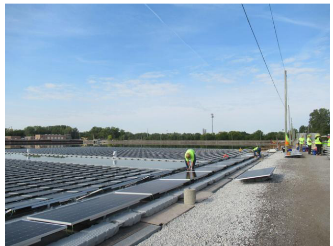
FIGURE 4. Microgrid at Fort Wayne, Indiana Water Pollution Control Plant

Fort Wayne installed a 6.71 megawatt floating solar photovoltaic system with battery backup at its sewer plant. This system will provide backup power to the water and sewer plants in the event of a grid failure while reducing operating costs and emissions. 31,32