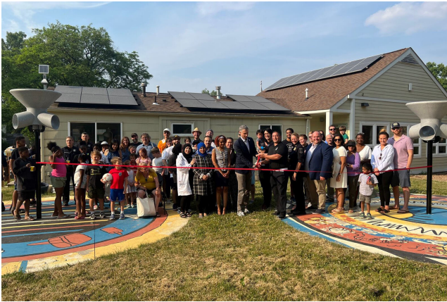
FIGURE 3. Bryant Community Center Resilience Hub (Ann Arbor, Michigan)